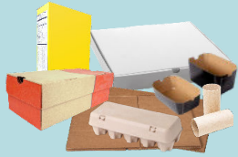
Cardboard and boxboard