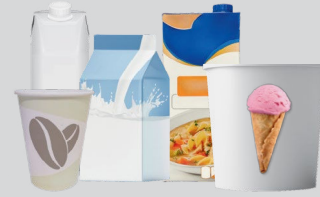
Cartons and cups