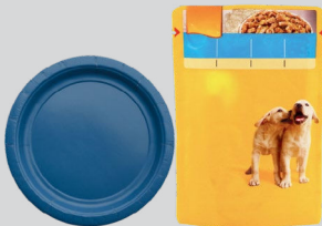
Paper laminate packaging