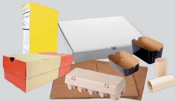
Cardboard and boxboard