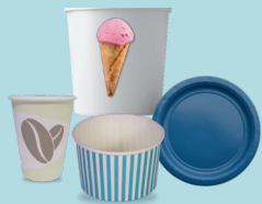
Paper laminate packaging