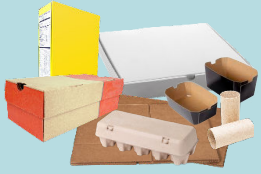
Cardboard and boxboard