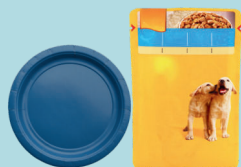
Paper laminate packaging