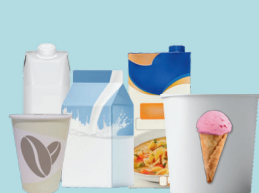
Cartons and cups