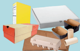
Cardboard and boxboard