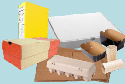
Cardboard and boxboard