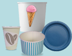
Paper laminate packaging