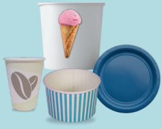
Paper laminate packaging