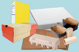
Cardboard and boxboard