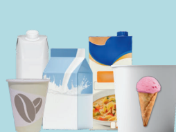
Cartons and cups