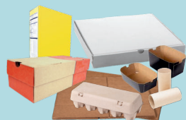
Cardboard and boxboard