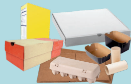
Cardboard and boxboard