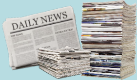
Newspapers and catalogs